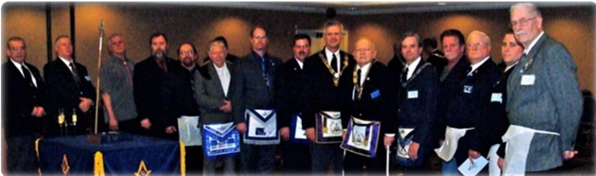
Grand Lodge of Alaska sitting Worshipful Masters for 2011.

Observing The Craft is currently available online for $15.99 through book sellers: amazon.com and lulu.com . It will soon be featured as a "Short Talk Bulletin", published by the Masonic Service Association of North America.